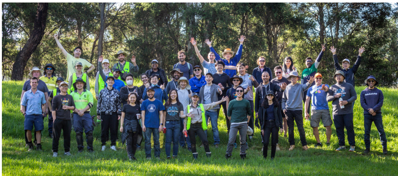
Volunteers at a Creating Canopies tree planting event.