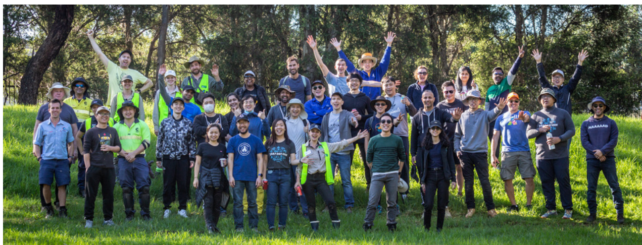
Atlassian's corporate volunteering day with Greater Sydney Landcare, tree planting in the Cumberland LGA.