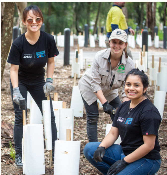
KPMG corporate volunteers planting with Greater Sydney Landcare at Nurranginy Reserve.

GSL believes that corporate engagement can help us deliver on-ground environmental activities, provided those activities are in the interest of GSL, biodiversity, water quality and Landcare.